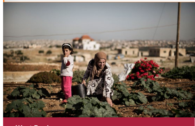
West Bank

In conflict-affected situations, delivering social protection through a conflict-sensitive approach is essential to first "do no harm". Building on what communities are doing to effectively respond to crises and protect community members as well as supporting transitional service delivery may also build peace and social cohesion, although more research is needed to understand if and how supporting social protection or service delivery can contribute to peace and state-building (CFS, 2015).