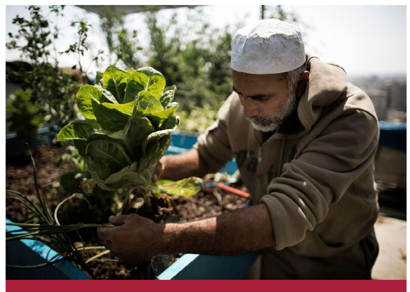
Gaza Strip